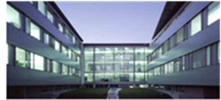
Revija Delo in varnost

https://www.zvd.si/varnost-pri-delu/izobrazevanja-in-publicistika/zvd-revija-delo-in-varnost/